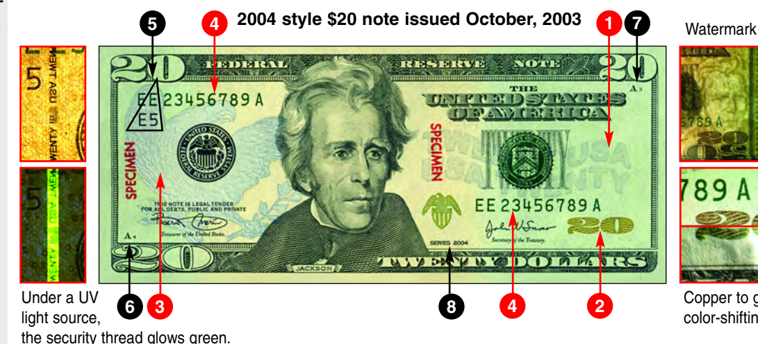
Copper to green color-shifting ink